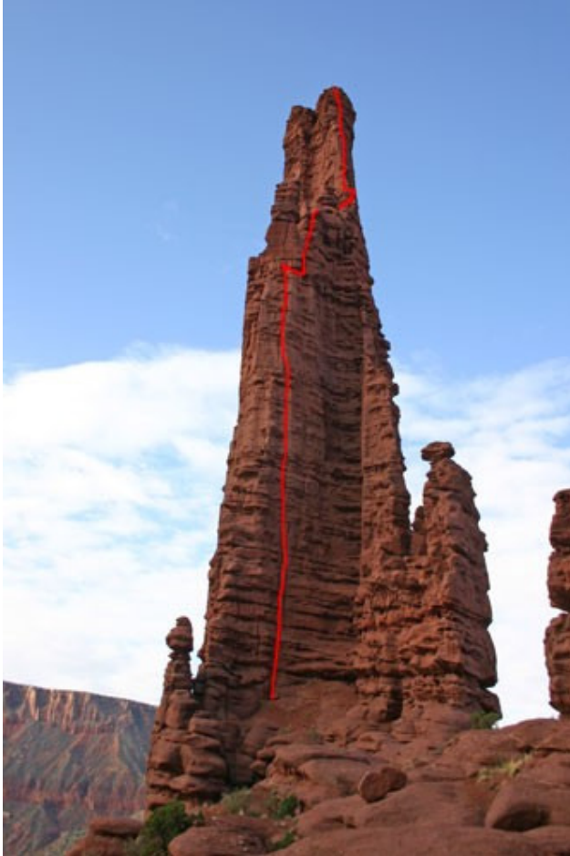
The Titan tower with the route marked.