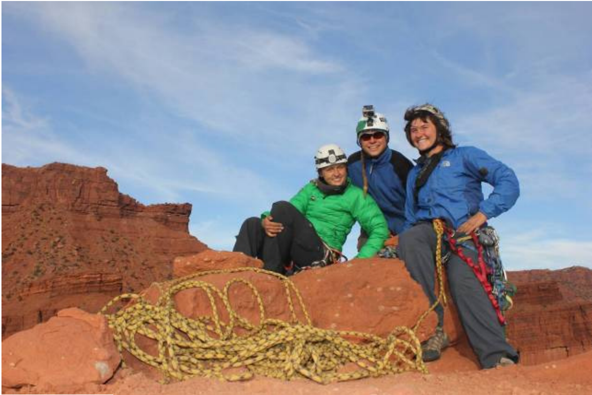
The team on the top.