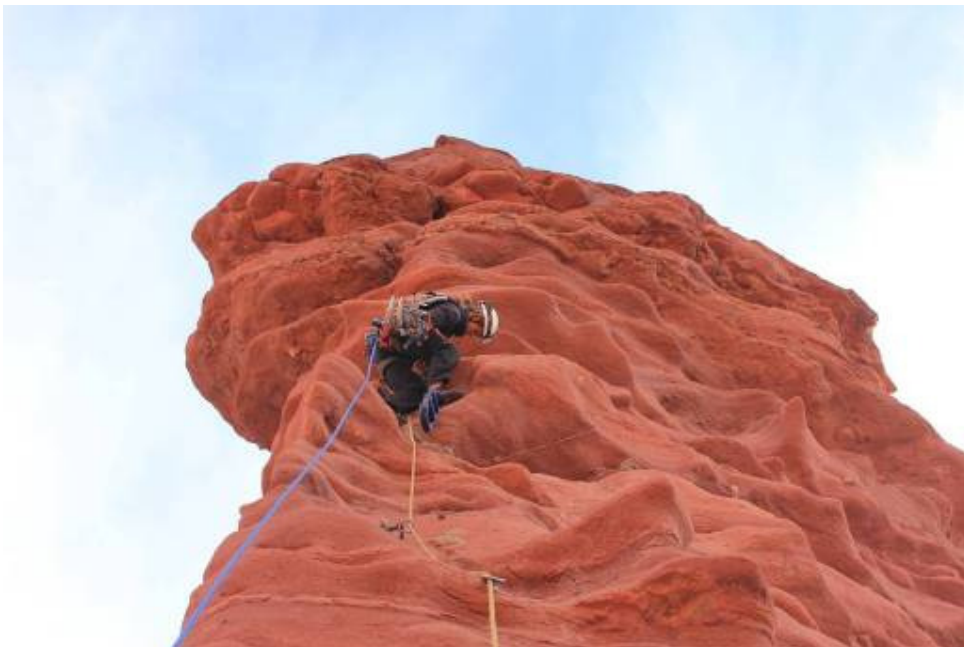
Saulé climbs the penultimate pitch through the oddly formed bumps.

The temperature was perfect for climbing. The next day after we got back, the forecasts proved to be right – the desert was hit by the storm.